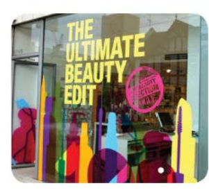
Approximately 40% tinted decal which includes a 5% solid graphic decal